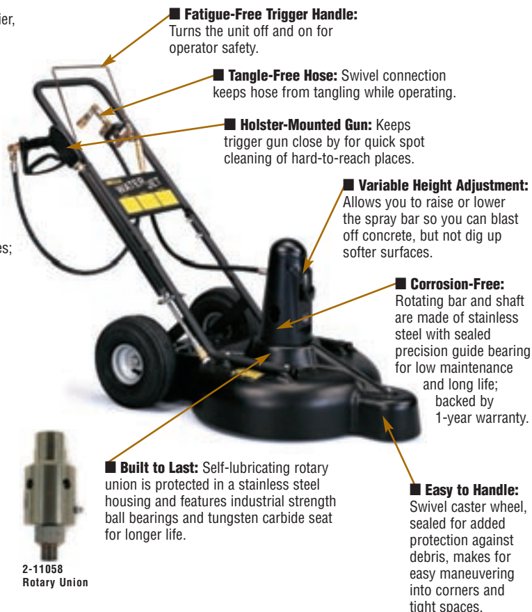
2-11058 Rotary Union